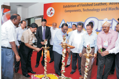
Inauguration of Ambur Open 3

Association of Footwear Components, Accessories and Machinery Manufacturers of India (AFCAMMI) is a trade association formed with the support of EDI's