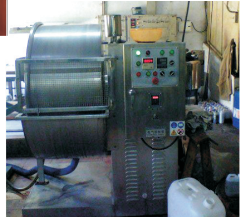
Fine tuning is necessary in processing while using recovered water

It is estimated the chemical savings will amount to about Rs.3235 in processing one tonne of raw material from raw to finish.