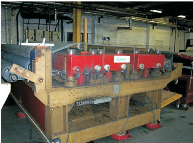
Vibratory Staking machine

Staking in modern vibratory staking machines is also noisy, but not easy to eliminate at source. The best solution in this case is to have the machine in a separate area with the operator and assistants provided with ear muffs.