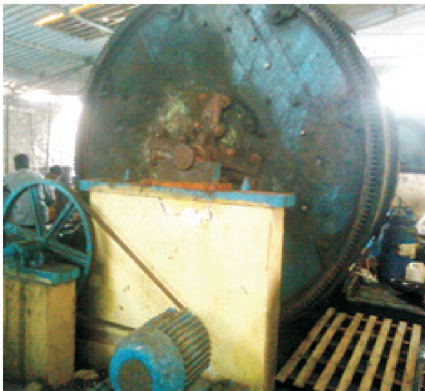
Local Tanning/Dyeing Drum