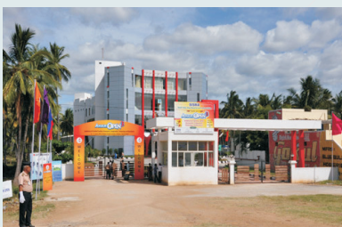
Ambur Trade Centre, Ambur

BDS Market Development Project. AFCAMMI was the co-organizer of Ambur Open 3, the Exhibition of finished leather, accessories, components, technology and machinery on 6, 7 June 2012 in Ambur Trade Centre, Ambur, organized by Indian Shoe Federation.