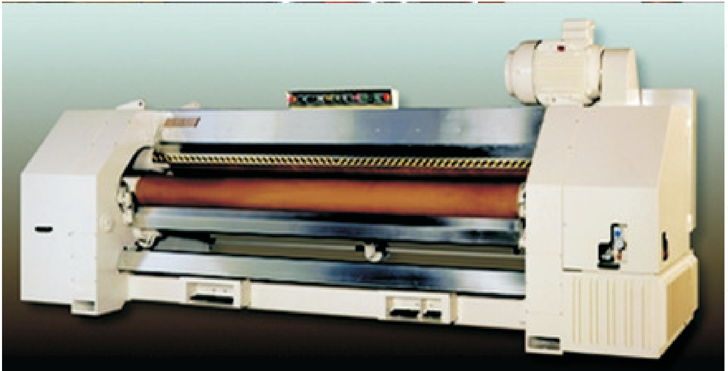
Setting Machine (imported)