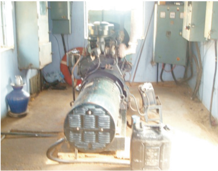
DG Set without enclosure