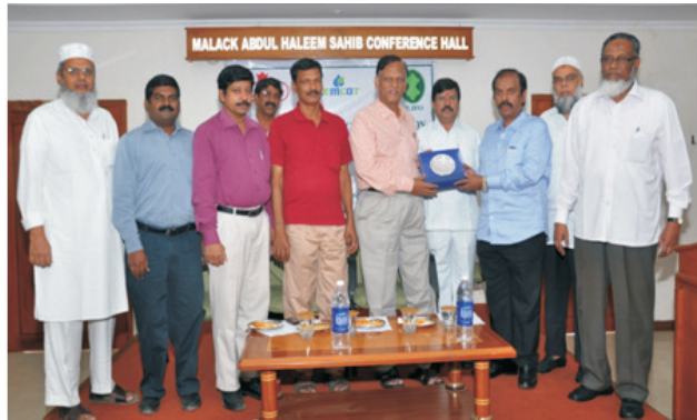
Interactive session in Ranitec CETP on use of recovered water

There is a perception that the use of recovered water could save some amount of chemicals. Ranitec CETP came forward to disseminate the information to the tanneries on how to fine tune the processes to its member tanneries. Accordingly ILIFO conducted trails in lab scale as well as commercial